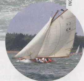
Top: The biggest entry was the 49.5m schooner Eleonora, a replica of the 1910 Herreshoff Westward. Inset: Jap was the oldest boat and won overall

Sailing a classic boat is like taking a piece of Chippendale furniture and throwing it into the sea, and then steering other bits of Chippendale furniture within inches of it," said Griff Rhys Jones to the 350 guests at the prize-giving dinner concluding Panerai British Classic Week in July.