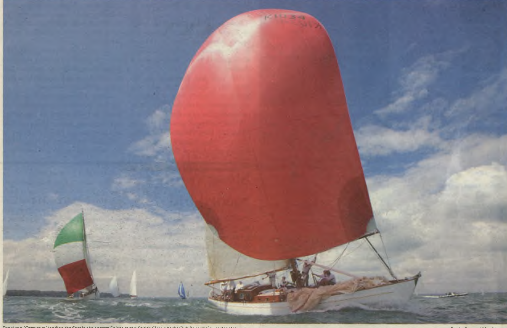
The sloop "Cetewayo" leading the fleet in the eastern Solent at the British Classic Yacht Club Panerai Cowes Regatta